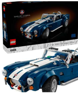
Donated by: HDA Engineering

Bring your cash as tickets will be sold for: 1 for $10, 3 for $20, or 10 for $40.