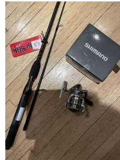
Donated by: MacPherson Engineering