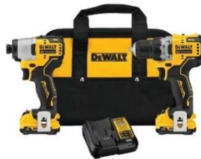
Donated by: R J England Consulting