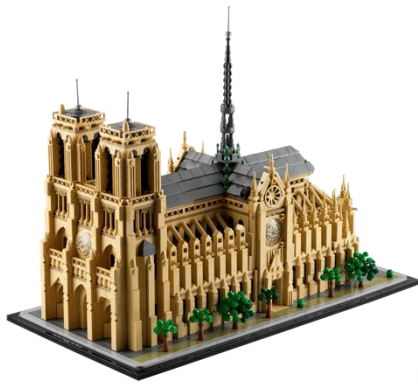
Donated by HDA Engineering