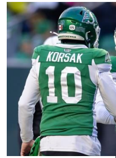
Donated by: HVAC Sales

Tickets are still available for the ASHRAE Regina Chapter Super 50/50 . Tickets will be available all year long with the draw being held at the May Chapter meeting. Each ticket is $20, and the winner will take home half of the jackpot.