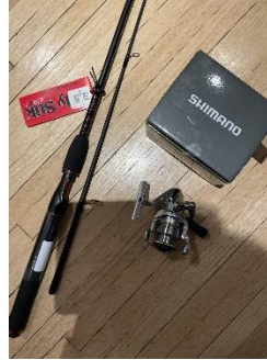
Donated by: MacPherson Engineering